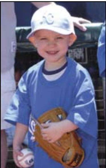
A very happy Honorary Lineup participant.

The Temple, Congregation B'Nai Jehudah Theatre for Young America Theta Tau Omega Thomas Jefferson High School TJ White Memorial Tourney TLC for Children and Families TMC Behavioral Health Network TNC Community Tomahawk Elementary School Tony Aguirre Community Center Topeka Collegiate School Topeka High School Topping Elementary Trenton Area Chamber of Commerce Tri-City Preschool & Tri-City League Tri-Country Mental Health Services Tri-Country YMCA of the Ozarks Trinity Lutheran Church Preschool Troop 374 Alumni & Friends Troy Area Chamber of Commerce Truman Basketball League Truman Elementary Truman High School Truman HS Patriots Football Program Truman Medical Center-Lakewood Tulsa Drillers