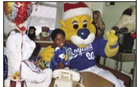
Sluggerrr visits a young patient in Topeka.

Butler Manufacturing Company Calvary Baptist Mission Team Cancer Action, Inc Caring & Sharing CASA Children's Advocates Cathedral School Catholic Charities CCA Fundraising Center Point-Urbana Boy Scouts Central Elementary School Charlton IA 4th of July Committee Children's Center for the Visually Impaired Christ the King Parish